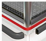
Composites and Plastics Processing